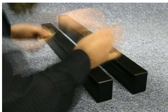
Final production of Stoll Picoline

In the course of renovating the Swiss Parliament Building, Stoll Audio developed and manufactured more than 40 loudspeakers (a loudspeaker column called "Picoline") for voice reproduction according to the product requirements of the Walters-Storyk Design Group (WSDG).