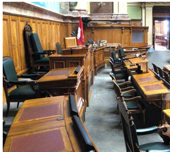
Stoll Picoline 585 on stage (Chairman of Parliament)

23 "Picoline 585" were made for the stage of the National Council's Hall plus 20 "Picoline 490" for the grand stand (spectators' area). Owing to the mass production of the aluminium cabinets with 40mm width, 58mm depth and 490mm or 585mm length respectively, the target of a compact design was achieved. The super low-distortion loudspeakers brought about a significant improvement of the measured Speech Transmission Index (STI).